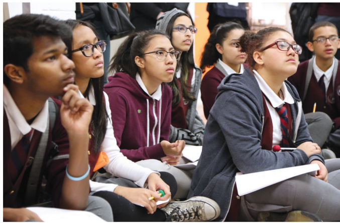
PS 171 middle school students participated in brain-related activities.